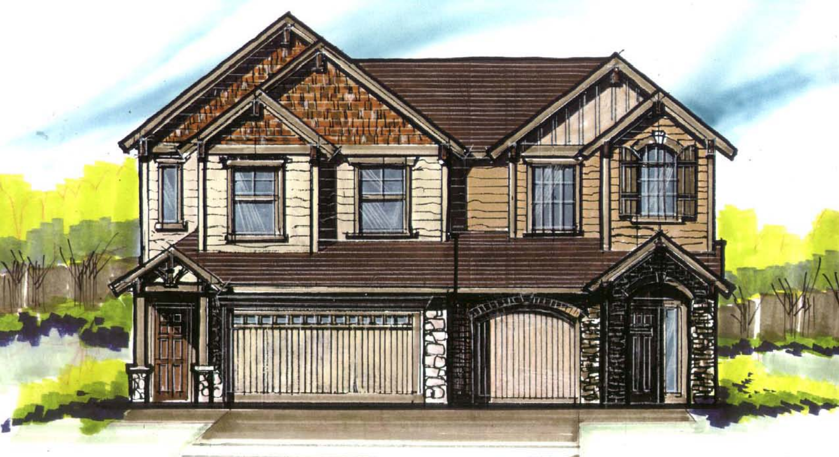
Unit 1 Main 693 Sq. Ft.